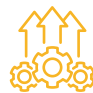
Chart business-technology vision and roadmaps that enable you to capitalise on emerging technologies to drive revenue, profitability, customer experience, and innovation.